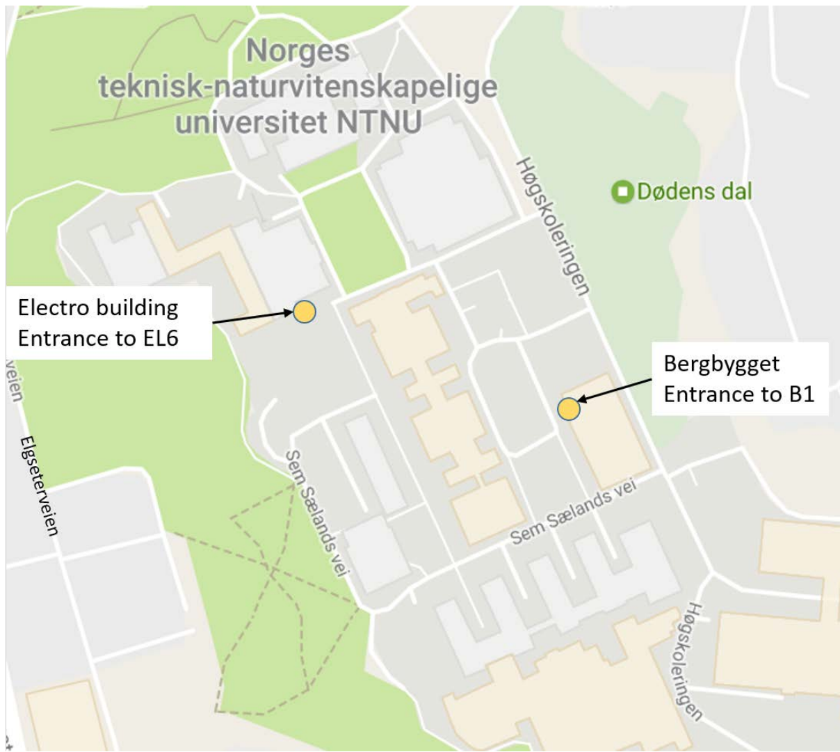
Figure 2: University campus.