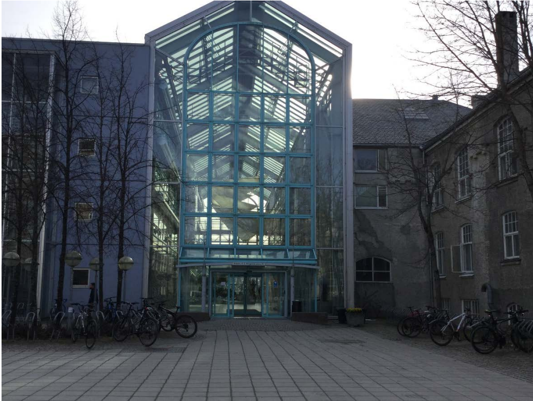
Entrance Electro building. Follow corridor to the right to find EL6 and registration.